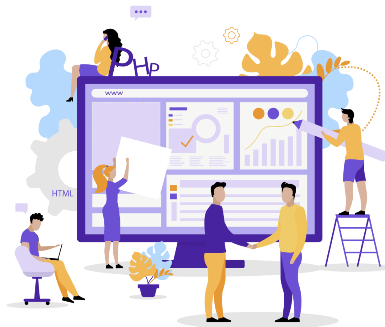
A PUBLIC COMPANY

Investing in stock : buying shares of ownership in a public company